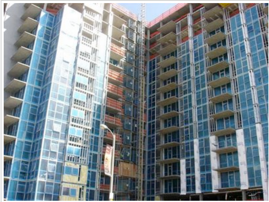
The Bank Lofts, two dark red buildings at 8th and Mesa Streets, is preparing to open models and welcome its first homeowners this month.