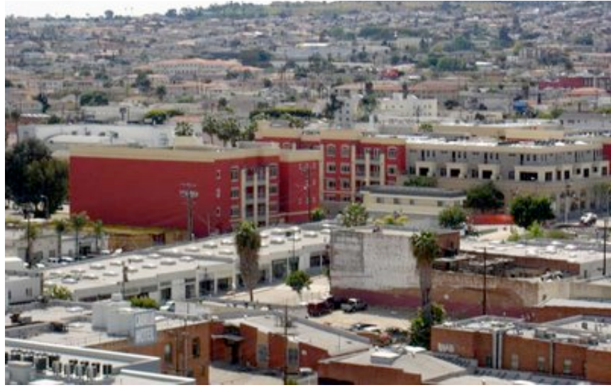
The Bank Lofts, as seen from the top of the Vue.

The models and almost-completed units are in the building on the east side of Mesa Street.